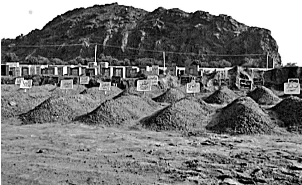
After the 2010 massacre: Ahmadi graves at Rabwa

He describes the morbid celebration after the massacre and how “people danced and distributed sweets to commemorate this tragedy.”