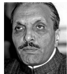
General Zia ul Haq

In addition, Zia introduced a host of discriminatory laws citing Islam as a justification but with a clear political agenda. Five ordinances that explicitly targeted religious minorities acquired legal status: a law against blasphemy; a law punish-